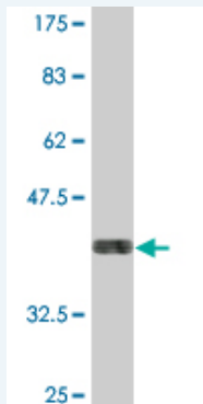
Western Blot detection against Immunogen (37.51 KDa) .

Quality Control Testing: Antibody Reactive Against Recombinant Protein.